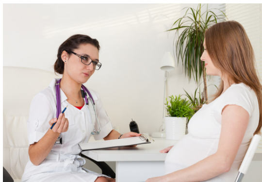
“Convincing Catholics that abortion is not really a moral issue, but a medical issue.” Catholic Straddle